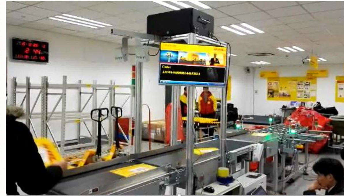
Code Reading Demonstration